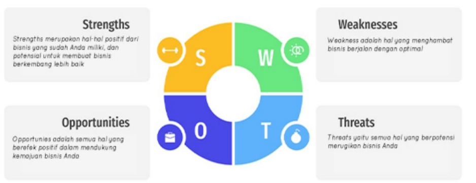
Figure 1 SWOT Analysis

c) Analysis must be based on actual conditions that are taking place, not on ideal conditions that should occur.