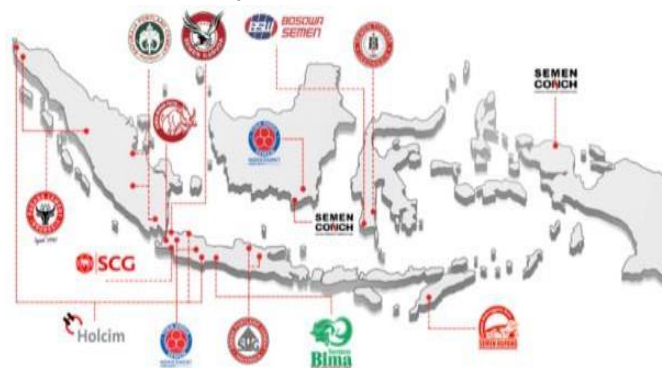
Figure 1. Map of Cement Factory Locations in Indonesia

The cement market in Indonesia has undergone significant changes, after a long oligopoly market, along with the arrival of foreign investors and local investors who were given permission to establish new factories in Indonesia, so the market shifted to monopsony (Wilson et al., 2020); (Sokolova & Sorensen, 2021). The presence of these new competitors spurred the incumbent brand to further increase customer satisfaction so as to increase brand loyalty.